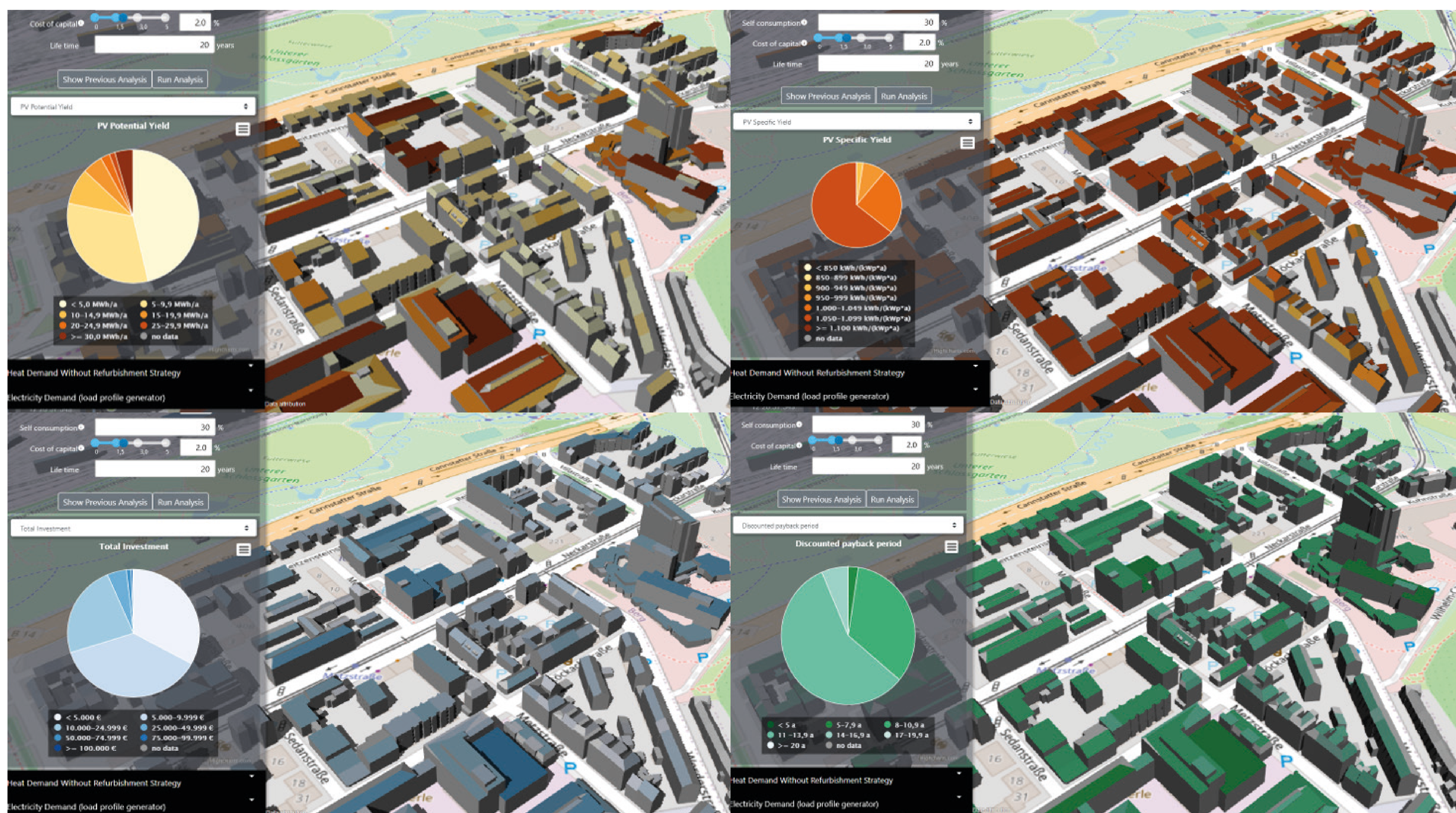
Fig. 1: Visualization options.

MUSI work packages built on the existing energy simulation platform SimStadt, which allows the detailed assessment of buildings' energetic performance or photovoltaic rooftop potentials based on 3D CityGML models. On the one hand, a customizable economic analysis was added to the pre-existing workflows for rooftop PV and building refurbishment measures, allowing the evaluation of amortization periods, total investment, or Levelized Cost Of Electricity (LCOE) for single buildings and whole city quarters. On the other hand, scenarios planning and displaying of the above-mentioned results were made accessible via a web browser by utilizing SimStadt API, an open-source 3D geospatial visualization library, and 3D Portrayal Service (3DPS).