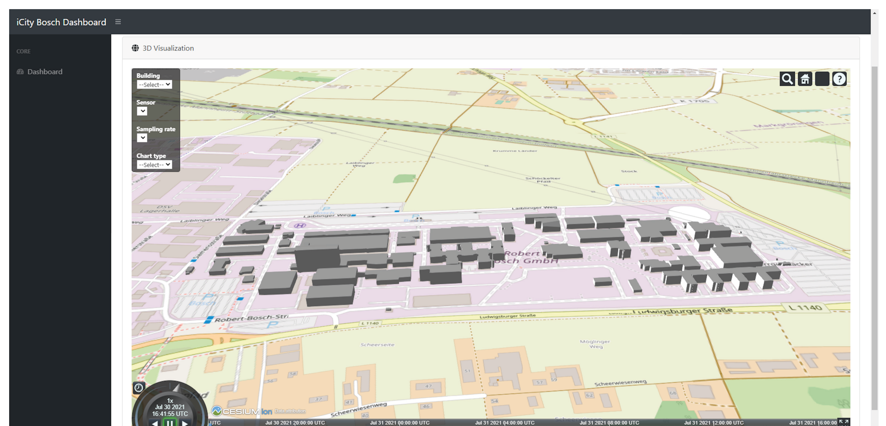
Abb. 2: The top part of the energy dashboard that contains the 3D visualization of buildings and selection options for the different sensors and charts.

The 3D visualization of the buildings is based on 3DTiles whereas the different chart types are created by retrieving sensor observations from the SensorThings API. The various charts provide different ways of visualizing and analyzing the temporal sensor observations, so as to gain new insights.